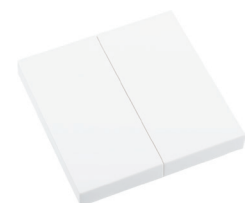
2x ON/OFF RTS23-ACC-01-xxP2