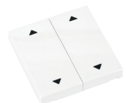
2x UP/DOWN RTS23-ACC-02-xxP2